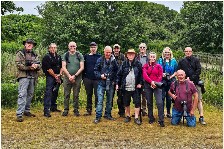
Stowmarket members at Minsmere

We run our own website ( https://stowmarketanddistrictcameraclub.onesuffolk.net/ ) and a less formal Facebook page ( https://www.facebook.com/groups/808510170396270 ) to keep members informed and the public made aware of our existence. Our subscription is £40 p.a. which is not quite enough to cover our costs which have seen significant increases in the last two years. We try to support our local Council as they do help us with a grant. We attended a Town Council Showcase event this year which demonstrated to the public what activities are available in the