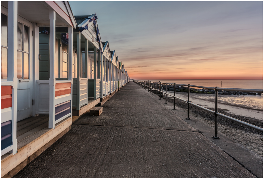
Next page below: 'A pure passion' by Brod Pooley.