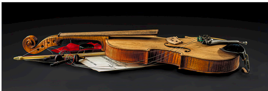
'The lost chord' by Roy Fidler of Stowmarket & DCC.

We have a range of speakers mostly taken from the EAF list who provide talks on a range of subjects. We also have two interactive Club nights. These Club nights are for members to partake in various activities such as photographic shoots, demonstrations