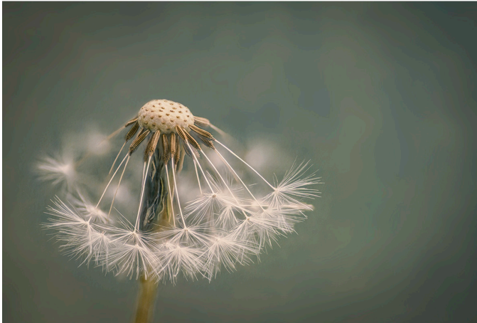
Top: 'The fleeting Nature of life' by Paula Irvine.